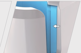
Available for 10-16oz