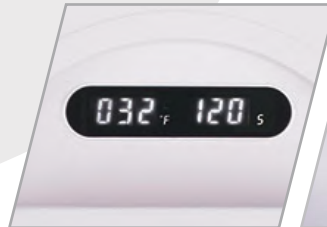
LCD Controller V2