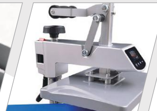
More Stronger Pressure Structure