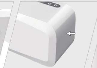
Internal Automatic Motor