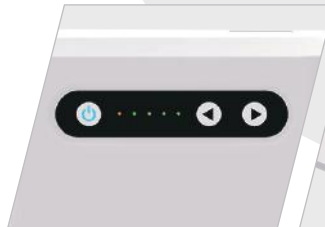
Simplified LCD Controller