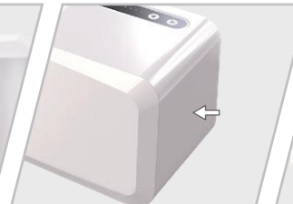
Internal Automatic Motor