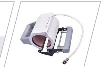
Seperate Mug Mate