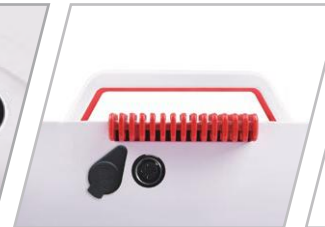
2IN1 Aviation Plug