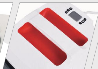
Handle to Carry and Press