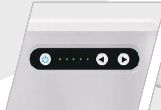
Simplified LCD Controller